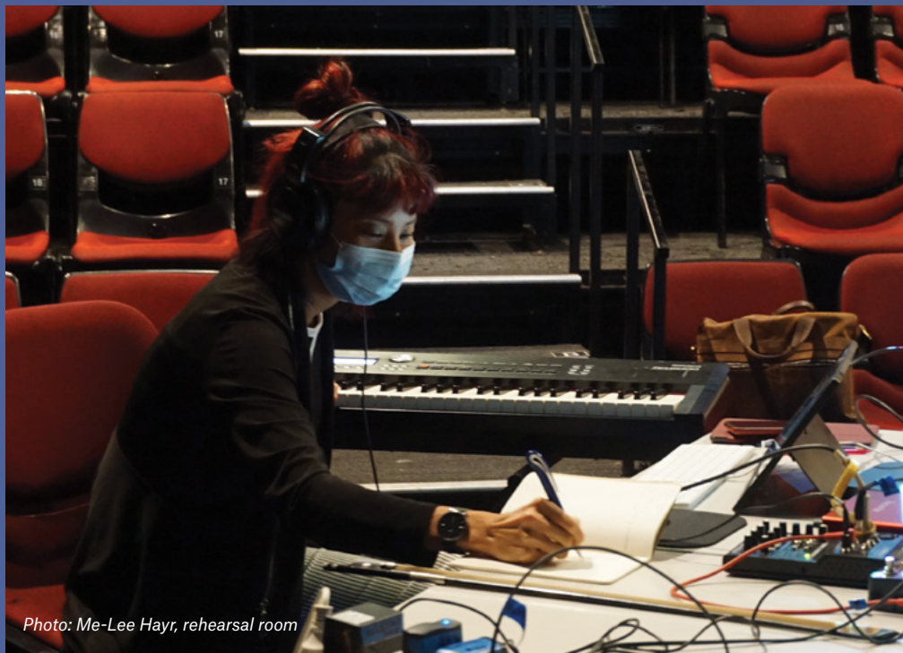
rehearsal room